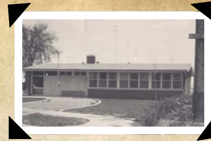
The Kent County Children's Treatment Centre at their new location on Eugenie Street, which today is Radiane Massage Therapy and Spa.

With support from the Ministry and Municipality, and strengthened by the Prism Foundation, the Centre has been confident in welcoming new staff while expanding and integrating services. Inspired by client and family goals, we look forward to celebrating abilities with our community and continuing our growth to form a Centre of Excellence.