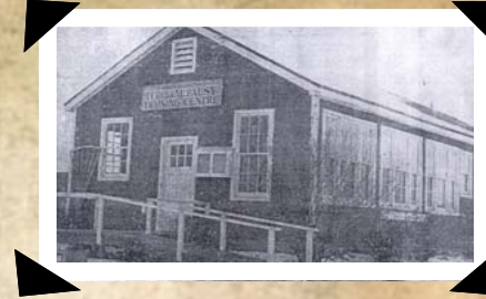
Kent County Cerebral Palsy Training Centre was the originated in 1948, located on Tweedsmuir Street in Chat-

The staff at the PRISM Centre continue to shine in their enthusiasm and ability to make a difference in the lives of children and their caregivers. As one of the four paediatricians in Chatham-Kent, I think I speak for all of us, when I say that we are proud to be a part of such a dynamic centre.